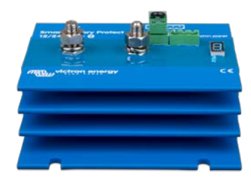
Smart BatteryProtect BP-220